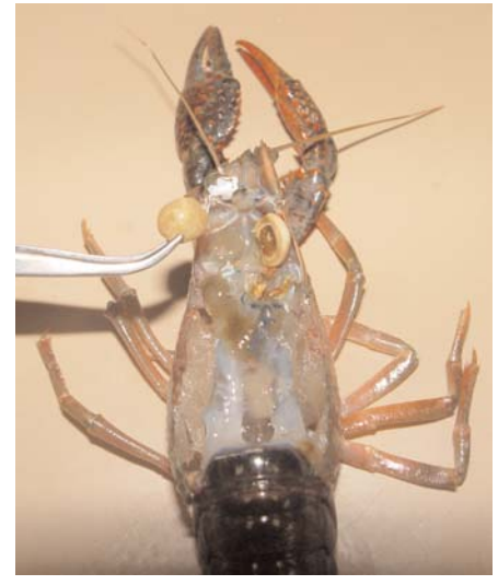
Figure 8. Gastroliths, paired bodies formed within the wall of the foregut ("stomach") during the premolt phase, store minerals from the old exoskeleton during molting.

Molting is controlled by hormones and occurs more frequently in younger crawfish than in older ones. The amount of growth that occurs during molting and the intermolt interval (or period between molts) can vary greatly; growth is affected mostly by environmental factors such as water temperature, water quality, food quality and quantity, and crawfish density. Research indicates that genetics plays a minor role in growth. Crawfish can increase up to 15 percent in length and 40 percent in weight in a single molt under optimal conditions.