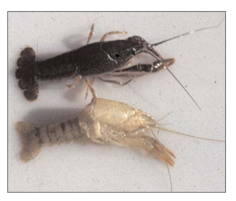
Figure 6. Soft, freshly molted crawfish (top) and its cast exoskeleton (bottom).

A crawfish must molt or shed its hard exoskeleton to increase in size (Fig. 6). Frequent molting and rapid growth occur in production ponds when conditions are suitable. Growth rate is affected by many factors, including water temperature, population density, dissolved oxygen levels, food quality and quantity, and genetic influences; however, environmental factors have the most influence on growth rate. Harvest size is typically reached within 3 to 5 months after hatching in the South, but it can be