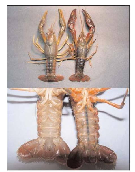
Figure 1. Adult white river crawfish (Procambarus zonangulus), top left, have longer, narrower claws than red swamp crawfish (Procambarus clarkii), top right. Red swamp crawfish (bottom right) usually have a dark line visible on the underside of the abdomen, whereas the white river crawfish do not.

The life cycles of both red swamp crawfish and white river crawfish have evolved to allow them to adapt to the cyclical low-water dry conditions and high-water flood conditions common to their natural habitats. Commercial crawfish aquaculture simulates this hydrological cycle, but with precise control over when ponds are flooded and when they are dewatered to optimize recruitment and subsequent crawfish production. Mature animals mate in open water and the sperm are stored in a seminal receptacle (annulus ventralis) on the underside of the female. The female may mate with more than one male and eventually retreats to the burrow to spawn. Although spawning can take place in open water, the burrow provides protection while the eggs and offspring are attached to the abdomen. Females carrying eggs or hatchlings are highly vulnerable to predators because the attached brood prevents the typical escape response, which is repeatedly