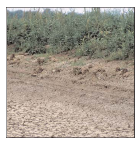
Figure 3. Crawfish burrows appear near the water line in ponds when mature crawfish begin burrowing for reproduction. Burrows may or may not have the typical "chimney" associated with the entrance. The density of burrows in this photo is extremely high.

In mature females, eggs usually begin to develop before burrowing and complete development in the burrow. As they mature, eggs within the ovary become spherical, enlarge, and change color from white or cream to dark brown (Fig. 4). At maturity, the large, dark eggs are expelled through the oviducts, fertilized externally with sperm that have