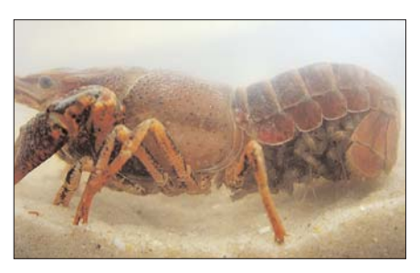
Figure 5. Female with hatchlings attached to swimmerets beneath the abdomen.

been stored in the seminal receptacle, and then are attached to the swimmerets (pleopods) under the tail (abdomen) with an adhesive substance called glair. Although crawfish can survive in a very humid environment within the burrow, they must have free-standing water for spawning. The number of eggs laid varies with the size and condition of the female and usually ranges from 200 to 300. Large females (more than about 15 count, 30 g) can have more than 500 eggs.