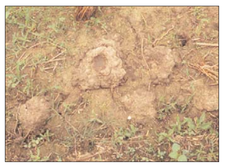
Figure 7. Active crawfish burrows will eventually become sealed with a soil plug or cap. With time and weather, and covering by vegetation, the burrow entrance may become inconspicuous.

tions, but it is thought that any free water in a burrow is likely to be trapped water, perhaps from rainfall seepage, rather than water seeping into the burrow from the water table. When there is no standing water in the burrow, wet mud in the chamber serves as a humidifier. This can sustain crawfish but is not conductive to spawning. The burrow walls and terminal chamber are extensively worked by the crawfish, possibly to ensure good seals. The entrance of the burrow, which often has a chimney or stack of the excavated soil, is eventually closed with a mud plug (Fig. 7). Burrow entrances at the water's edge are often hidden under vegetation or woody debris. Over time, the burrow entrance may become undetectable because of weathering and vegetative growth.